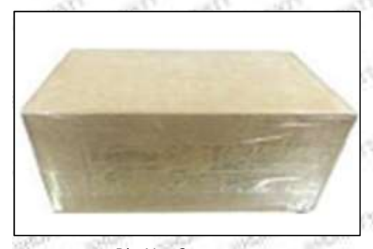
Pic No. 2 Domestic express packaging: Wrapped with Transparent tape

Minors are prohibited from using transparent tape, yellow tape, black wrapping protective film, and white wrapping protective film to avoid personal injury.